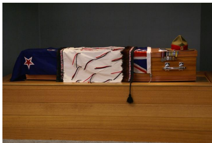
Lest we forget

Therefore, please let us know as veterans pass away in Australia so I can advise all the veterans in Australia. For NSW veterans, we try to attend wherever possible funerals of our comrades so please keep us informed.