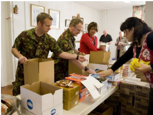
Defence Force personnel and RSA staff and volunteers package the parcels at HMS Olphert in Mt Cook, Wellington.

This year, back in September, almost 450 parcels were packed by personnel from the Defence Force, Police, RSA volunteers as well as students from Mt Cook School which is across the road from the National War Memorial and HMS Olphert where the parcels were packed. They included such Kiwi classics as Whittakers peanut slabs, Watties tomato sauce, Anzac biscuits, Christmas mince pies, marmite, chippies and onion dip ingredients, Jaffas and chewing gum, as well as handmade Christmas cards from school children from Papakura, Waiouru, Burnham schools and Wellington's Mt Cook school.