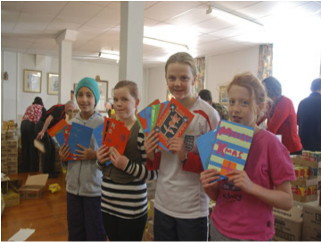
Students of Mt Cook School show the handmade Christmas cards for overseas personnel.

This year, back in September, almost 450 parcels were packed by personnel from the Defence Force, Police, RSA volunteers as well as students from Mt Cook School which is across the road from the National War Memorial and HMS Olphert where the parcels were packed. They included such Kiwi classics as Whittakers peanut slabs, Watties tomato sauce, Anzac biscuits, Christmas mince pies, marmite, chippies and onion dip ingredients, Jaffas and chewing gum, as well as handmade Christmas cards from school children from Papakura, Waiouru, Burnham schools and Wellington's Mt Cook school.