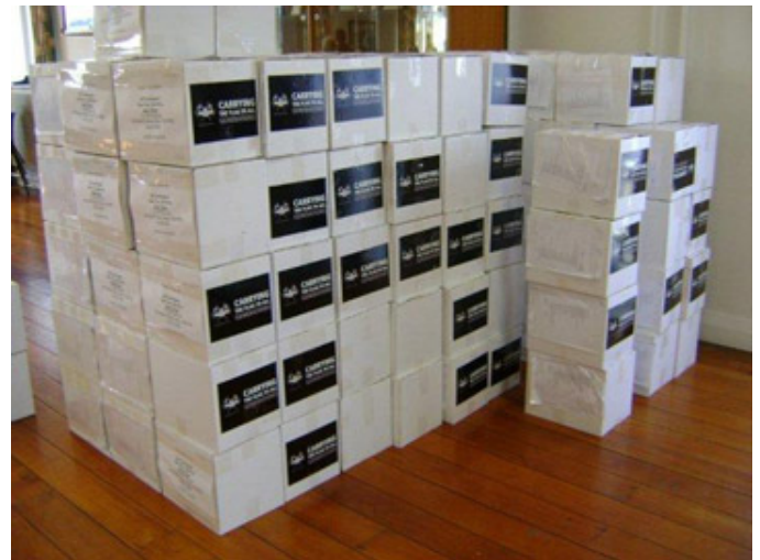
The Christmas parcels ready for deployment to 11 countries across the globe.

Our warmest wishes and Christmas greetings Kia Ora! Meri Kirimete! Kia Kaha!"