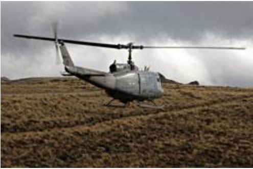
Image taken during Exercise Steel Talon, 2007(OH07-0814-52)

The skies above Tekapo will be buzzing with the sound of Iroquois